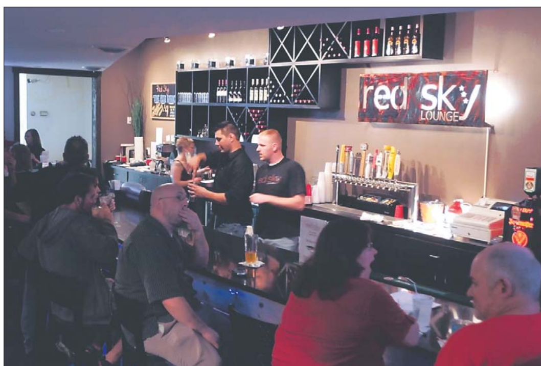
Red Sky has a crowd that comes in after work on weekdays and during the early hours of the evening. A much larger crowd forms at midnight for live music.

and catering to both the after-work crowd and happy hour customers, as well as those interested in the frequent weekday and weekend live music the venue offers.