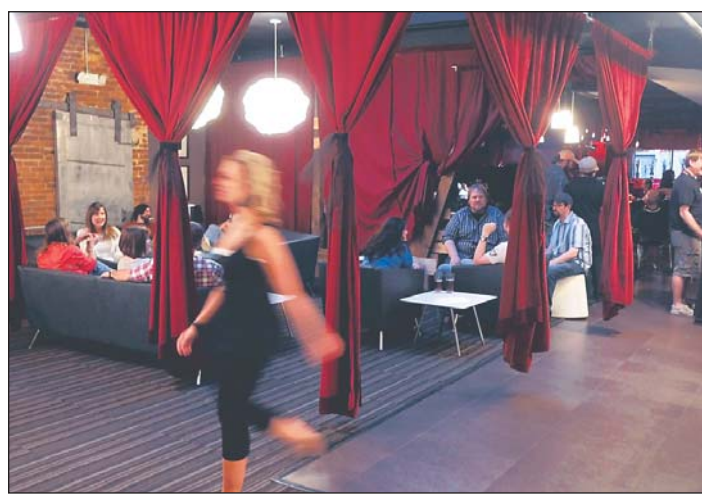
A long corridor broken up by sections of seating can hold many people during big shows.